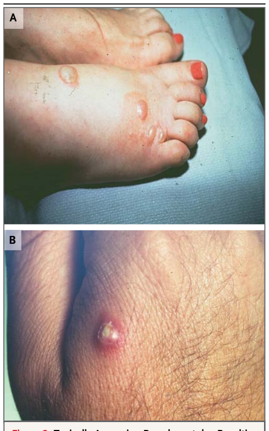
Figure 2. Typically Appearing Pseudopustules Resulting from Fire-Ant Stings.

Panel A shows pseudopustules on the feet of a child, and Panel B pseudopustules on a hand of an adult.