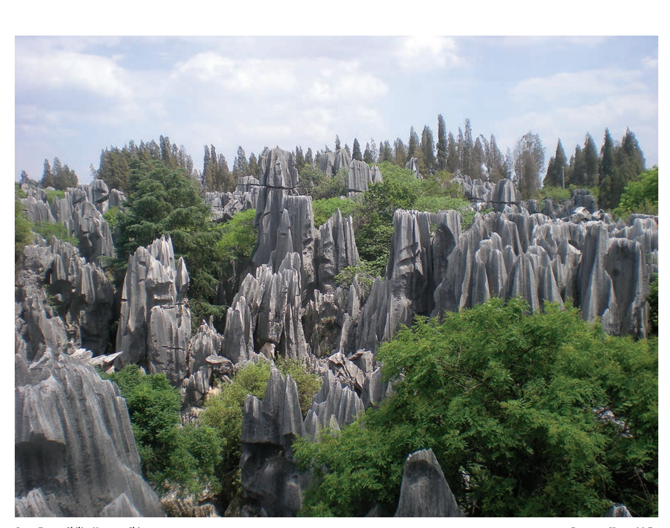
Stone Forest, Shilin, Yunnan, China