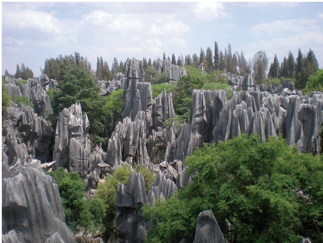
Stone Forest, Shilin, Yunnan, China

Copyright © 2014 Massachusetts Medical Society.